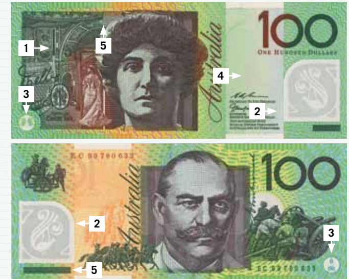
Actual banknote dimensions: 65 mm x 158 mm (images not to scale)

Under a magnifying glass you will see tiny, clearly defined words that read 'ONE HUNDRED DOLLARS' and the number '100'.