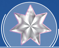
3D FEDERATION STAR