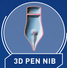
3D PEN NIB